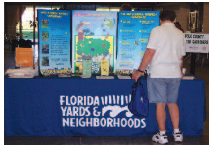
One of many informative exhibits at a previous Historic Home Workshop at FSC.

Panels focusing on design guidelines, building permits, financing and protecting an investment in a